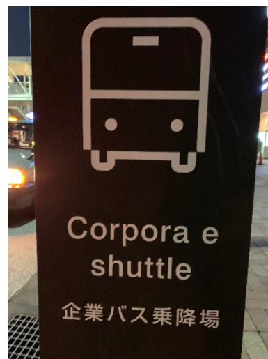
Shuttle bus of UTokyo and sign of the bus stop.